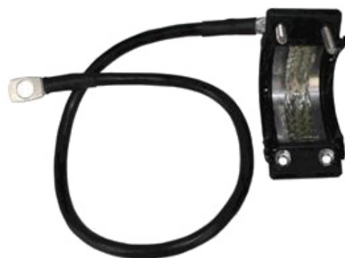
GKSPEED20-78P shown for illustration