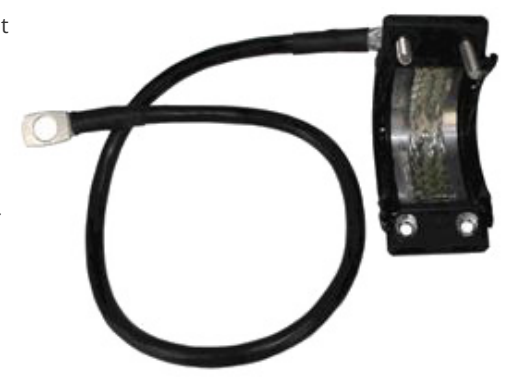
GKSPEED20-78P shown for illustration