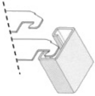
Type C For anchor bar (18-22mm slot)