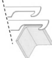
Type L For angle iron (in different sizes)