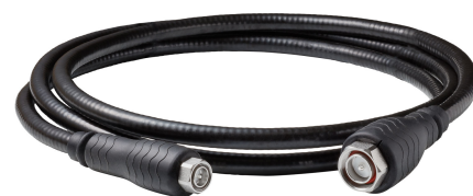
7MB43MBL12-0500FFP for EXAMPLE

ANATEL standard compliant jumpers available on request. Model number suffix xxx-ANA.