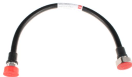
7M7MS12-0100FFP for EXAMPLE

Radio Frequency Systems' CELLFLEX® Factory-Fit Jumpers feature specially designed connectors which are soldered-on in a strictly controlled industrial process to ensure industry leading performance for today's high-performance wireless systems. The connector design and manufacturing process has been optimized to produce premium VSWR and IM levels. Injection molded boots provide reliable and repeatable additional sealing level and strain relief. Our facilities produce and stock all popular lengths as required by the industry, and can deliver custom lengths with premium VSWR and IM levels on request.