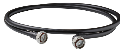
7M7MRL12F-0300FFP for EXAMPLE

Radio Frequency Systems' CELLFLEX® Factory-Fit Jumpers feature specially designed connectors which are soldered-on in a strictly controlled industrial process to ensure industry leading performance for today's high-performance wireless systems. The connector design and manufacturing process has been optimized to produce premium VSWR and IM levels. Injection molded boots provide reliable and repeatable additional sealing level and strain relief. Our facilities produce and stock all popular lengths as required by the industry, and can deliver custom lengths with premium VSWR and IM levels on request.