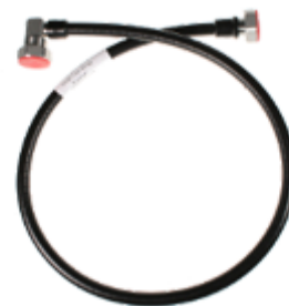
7M7MRS14-0100FFP for EXAMPLE

Radio Frequency Systems' CELLFLEX® Factory-Fit Jumpers feature specially designed connectors which are soldered-on in a strictly controlled industrial process to ensure industry leading performance for today's high-performance wireless systems. The connector design and manufacturing process has been optimized to produce premium VSWR and IM levels. Injection molded boots provide reliable and repeatable additional sealing level and strain relief. Our facilities produce and stock all popular lengths as required by the industry, and can deliver custom lengths with premium VSWR and IM levels on request.