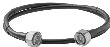
f. e. 43M43MS14-0100FFP