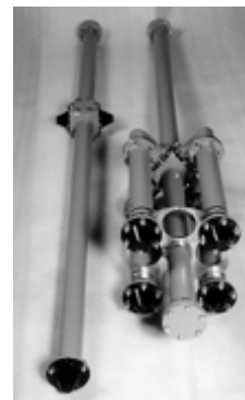
SPD power dividers.