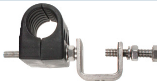
picture shows MBHS78-1-F for illustration purpose