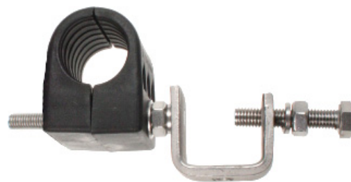
picture shows MBHS78-1-F for illustration purpose