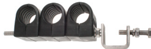
picture shows MBHS78-3-F for illustration purpose