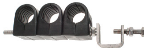
picture shows MBHS78-3-F for illustration purpose