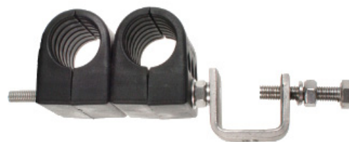
picture shows MBHS78-2-F for illustration purpose