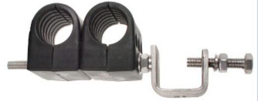
picture shows MBHS78-2-F for illustration purpose