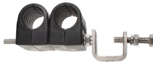
picture shows MBHS78-2-F for illustration purpose