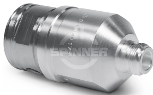
Connector N Socket CAF