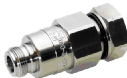
OMNI FIT™ Premium Connectors