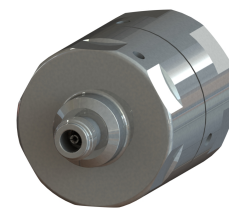
OMNI FIT™ Premium Connectors

N Female Connector for 1-5/8" Coaxial Cable, OMNI FIT™ Premium, Straight, O-Ring and compression sealing