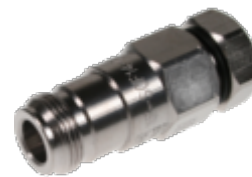
OMNI FIT™ Premium Connectors