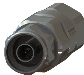
RAPIT FIT™ Connectors