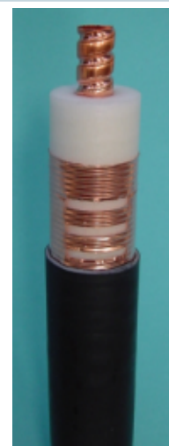
picture shows generic slot pattern