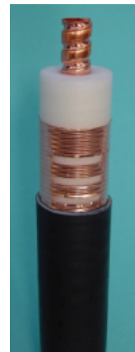
picture shows generic slot pattern