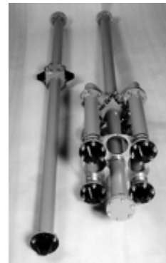
SPD power dividers.