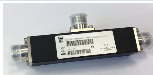
TPS10-43-555/6000 (similar product illustration)

RFS TPS* Tapper product family has been designed to support a variety of wireless applications in the frequency band from 555 to 6000MHz. The units couple off a defined fraction of a RF signal from typically 3 to 30 dB with minimal reflections or loss. The broad frequency range is ideally suited for 3G / 4G / 5G multi-band distributed antenna systems or in combination with RADIAFLEX® radiating cables. Notably, these products feature a low level of network interferences due to their PIM optimized desing.