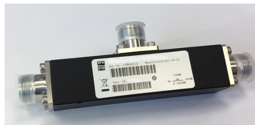
TPS13-43-694/3800 (similar product illustration)