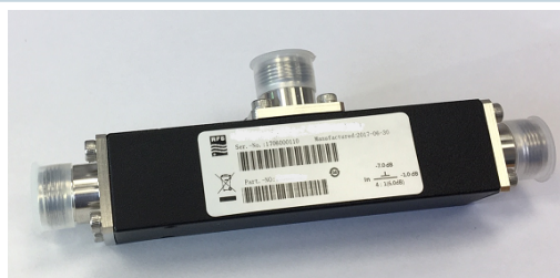
TPS13-43-694/3800 (similar product illustration)

RFS TPS* Tapper product family has been designed to support a variety of wireless applications in the frequency band from 694 to 3800MHz. The units couple off a defined fraction of a RF signal from typically 3 to 30 dB with minimal reflections or loss. The broad frequency range is ideally suited for 3G / 4G / 5G multi-band distributed antenna systems or in combination with RADIAFLEX® radiating cables. Notably, these products feature a low level of network interferences due to their PIM optimized desing.