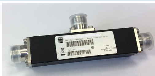
TPS15-43-694/3800 (similar product illustration)

RFS TPS* Tapper product family has been designed to support a variety of wireless applications in the frequency band from 694 to 3800MHz. The units couple off a defined fraction of a RF signal from typically 3 to 30 dB with minimal reflections or loss. The broad frequency range is ideally suited for 3G / 4G / 5G multi-band distributed antenna systems or in combination with RADIAFLEX® radiating cables. Notably, these products feature a low level of network interferences due to their PIM optimized desing.