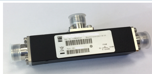
TPS15-43-694/3800 (similar product illustration)

RFS TPS* Tapper product family has been designed to support a variety of wireless applications in the frequency band from 694 to 3800MHz. The units couple off a defined fraction of a RF signal from typically 3 to 30 dB with minimal reflections or loss. The broad frequency range is ideally suited for 3G / 4G / 5G multi-band distributed antenna systems or in combination with RADIAFLEX® radiating cables. Notably, these products feature a low level of network interferences due to their PIM optimized desing.