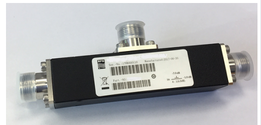
TPS15-43-694/3800 (similar product illustration)

RFS TPS* Tapper product family has been designed to support a variety of wireless applications in the frequency band from 694 to 3800MHz. The units couple off a defined fraction of a RF signal from typically 3 to 30 dB with minimal reflections or loss. The broad frequency range is ideally suited for 3G / 4G / 5G multi-band distributed antenna systems or in combination with RADIAFLEX® radiating cables. Notably, these products feature a low level of network interferences due to their PIM optimized desing.