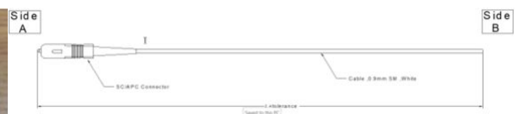
Drawing of a Pigtail