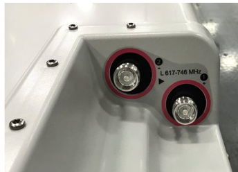
APXVAR18 Connector Close Up