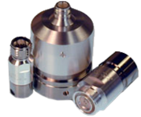
RAPID FIT™ Connectors