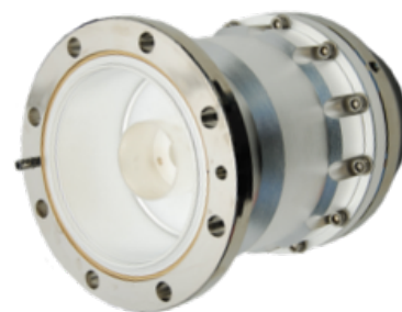
Connector 4-1/2" IEC