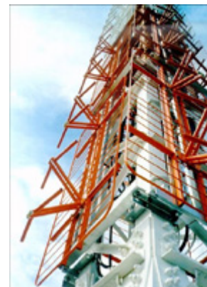
655 and 656 Antenna Series showing 656 Panel Array