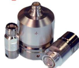
RAPIT FIT™ Connectors