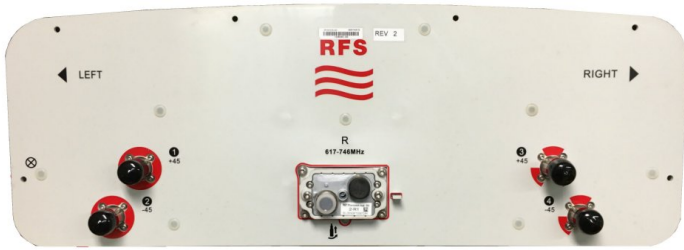
Dimensions: mm (in)

Dual Slant Polarized Dual Band (4 Port) Antenna, 617-746MHz, 65 deg, 15.6dBi, 2.4m(8ft), VET, RET, 0-11° Tilt Range