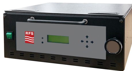
BD210WLP / BD212WLP

The dehydrator removes the moisture from damp ambient air to deliver a reliable, constant, ondemand source of dry and pressurised air, which is critical to prevent the systems from performance and reliability degradation by condensation. The BD210WLP series dehydrators offer pressurization solutions to transmission lines and antennas in both telecom and broadcasting applications. Its low pressure models (suffix LP) are suitable for applications where reduced pressure is required, for example, pressurisation of broadcast antenna radomes, microwave waveguides and other transmission lines. The inherent reliability of the BD series design, combined with the high output capacity and remote real-time data capabilities make these units an ideal choice for pressurisation of systems at unattended sites. The BD210WLP Series dehydrators employ a fully digital operating platform offering the most accurate readings of operating variables, either from the front panel or by a remote IP connection.