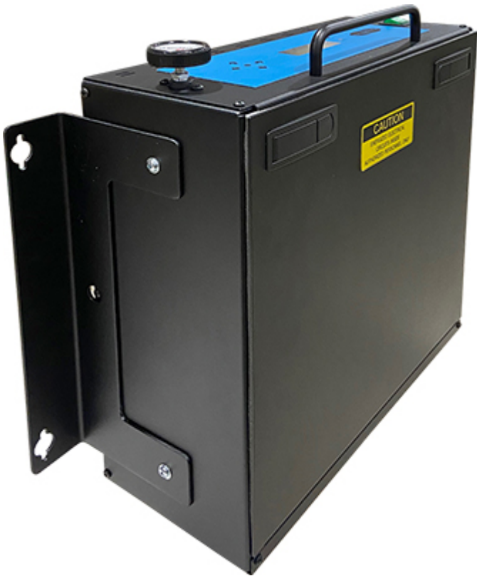
BD210WLP-V / BD212WLP-V

BD21*W* Automatic Dehydrator, 110-125 VAC 50/60Hz or 208-253 VAC 50/60Hz