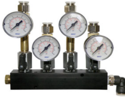
PWM4G : 4-Port Manifold with Pressure Gauges