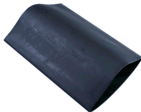
1pcs shrink tube out of pack of 10